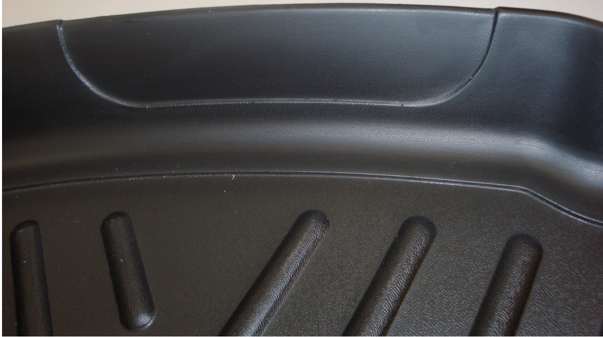
PHOTO SHOWING PART #42051 TRIMMED TO ALLOW ACCESS TO CARGO HOOK AND CARGO NET RETAINER.

PHOTO SHOWING PART #42051 CARGO HOOK AND CARGO NET RETAINER RELIEF AREA. NOTE: TRIM THIS AREA AWAY TO ALLOW EASY ACCESS TO THESE HOOKS. USE THE MOLDED IN STEP IN THE PART AS YOUR TRIMMING GUIDE.