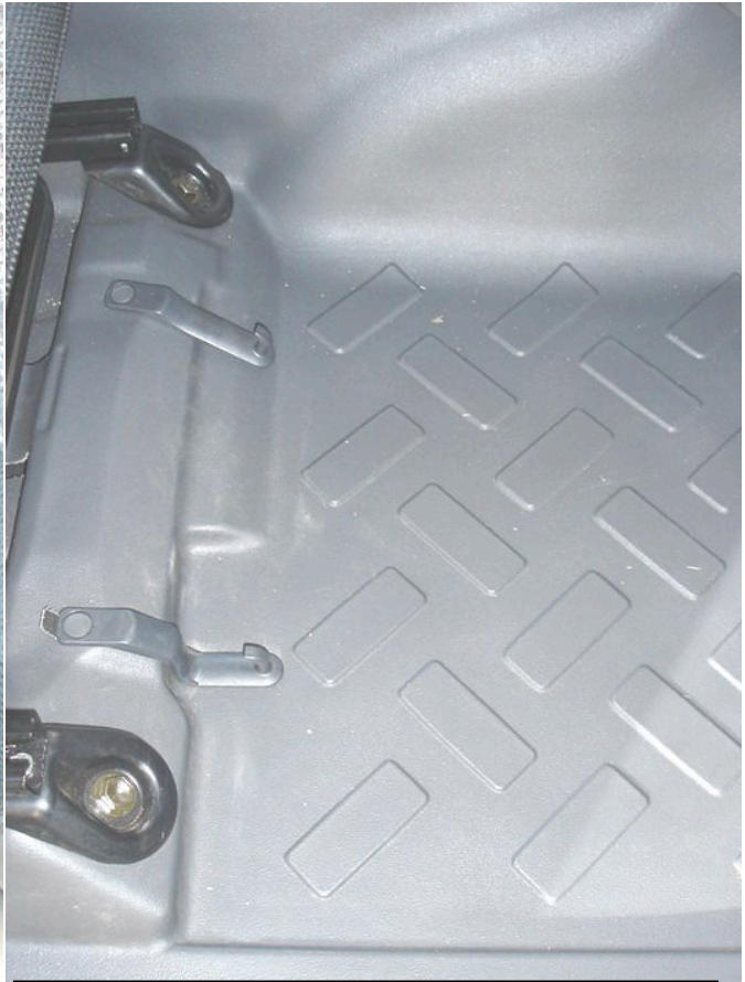
FJ CRUISER PASSENGER'S SIDE FLOOR PAN WITH MAT HOOKS INSTALLED