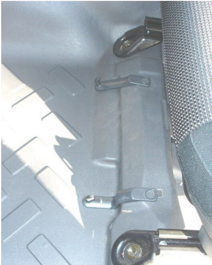
FJ CRUISER DRIVER'S SIDE FLOOR PAN WITH MAT HOOKS INSTALLED