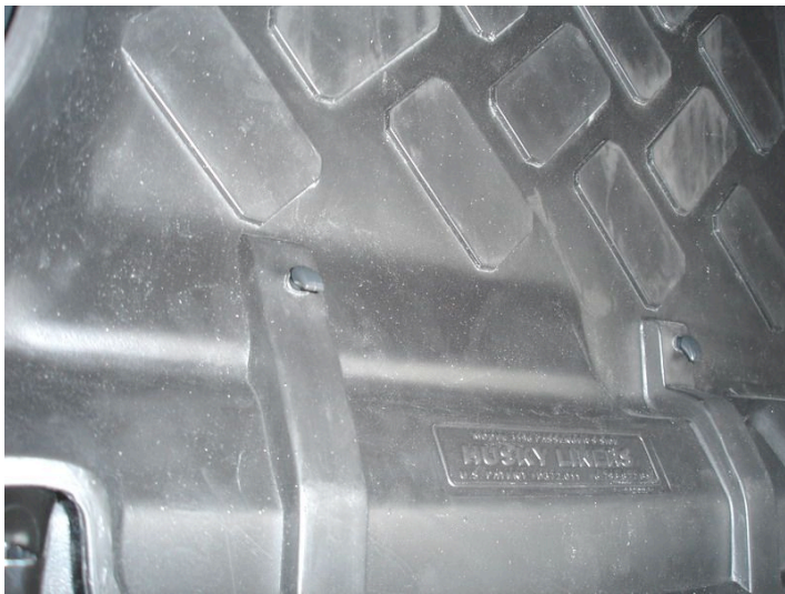
HUSKY LINER PART #3596 SHOWN INSTALLED IN THE FJ CRUISER. NOTE THAT LINERS MUST BE ATTACHED OVER FACTORY MAT HOOKS TO HELP SECURE LINERS IN POSITION.