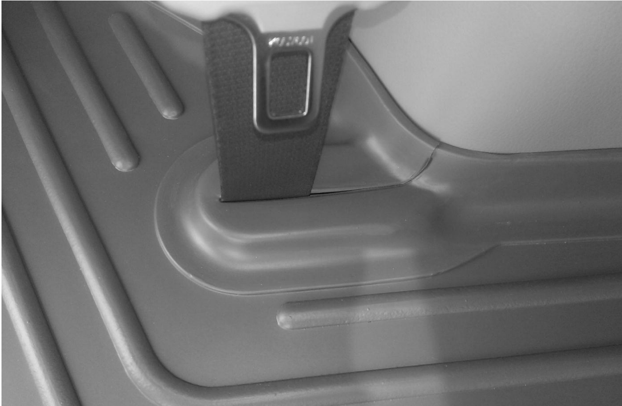
IMAGE SHOWING LINER TRIMMED AND SEAT BELT INSERTED INTO TRIMMED SLOT.