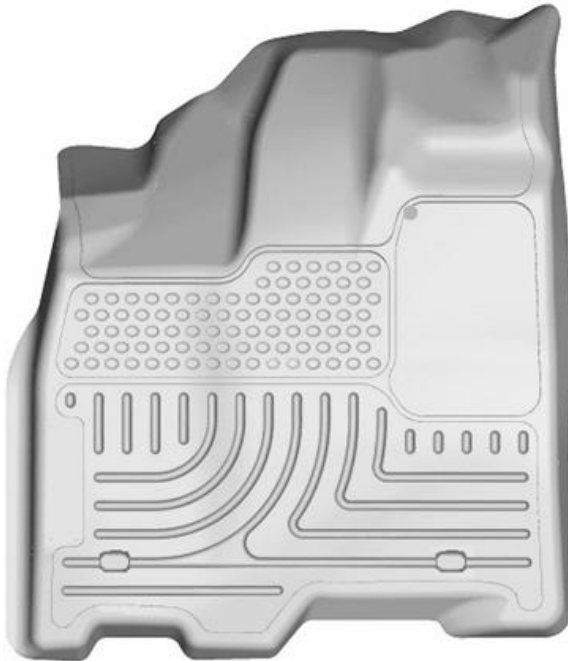
LEFT OR DRIVER'S