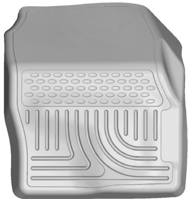
RIGHT OR PASSENGER'S SIDE

TO EASE INSTALLATION OF YOUR TRANSIT CONNECT FRONT LINERS, MOVE BOTH FRONT SEATS TO THEIR MOST REARWARD POSITION. ONCE YOU HAVE INSTALLED YOUR LINERS, REPOSITION THE SEATS AS DESIRED. TAKE CARE THAT DRIVER'S SIDE LINER IS ATTACHED TO THE FACTORY FLOOR MAT POSTS.