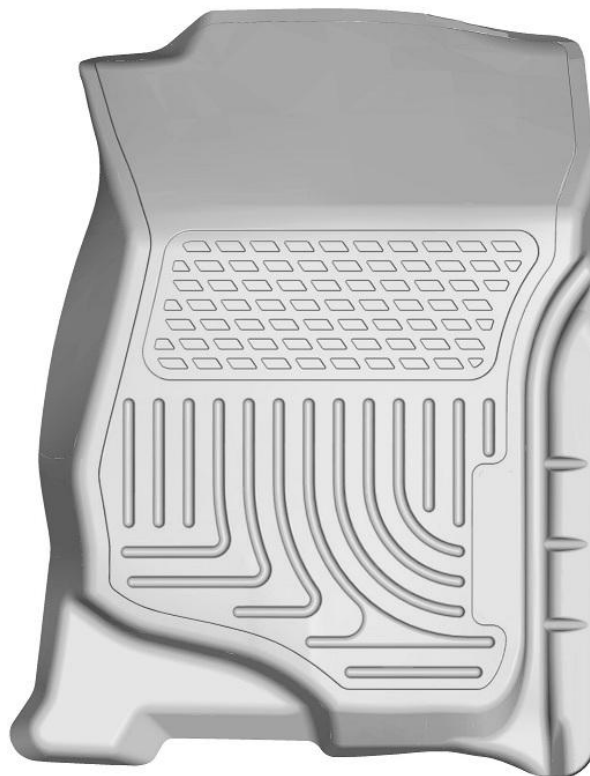
RIGHT OR PASSENGER'S SIDE

TO EASE INSTALLATION OF YOUR NEW FRONT LINERS, MOVE BOTH FRONT ROW SEATS TO THEIR MOST REARWARD POSITION. ONCE YOU HAVE INSTALLED YOUR LINERS, REPOSITION THE SEATS AS DESIRED. SEE INSTRUCTIONS ON THE BACK OF THIS SHEET FOR INFORMATION REGARDING RETAINER CLIP INSTALLATION.