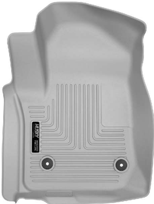
LEFT OR DRIVER'S SIDE