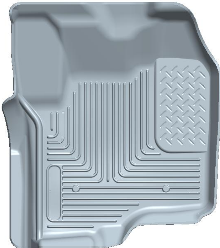
LEFT OR DRIVER

Your liners are made from an engineering resin that is lightweight and extremely tough and durable. The easiest way to clean your liners is with a damp cloth or sponge and soap and water. Windex®, 409® and ArmorAll® type cleaners work as well.