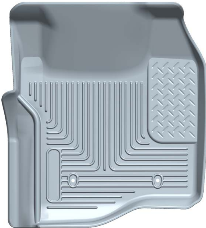
LEFT OR DRIVER

Your liners are made from an engineering resin that is lightweight and extremely tough and durable. The easiest way to clean your liners is with a damp cloth or sponge and soap and water. Windex®, 409® and ArmorAll® type cleaners work as well.