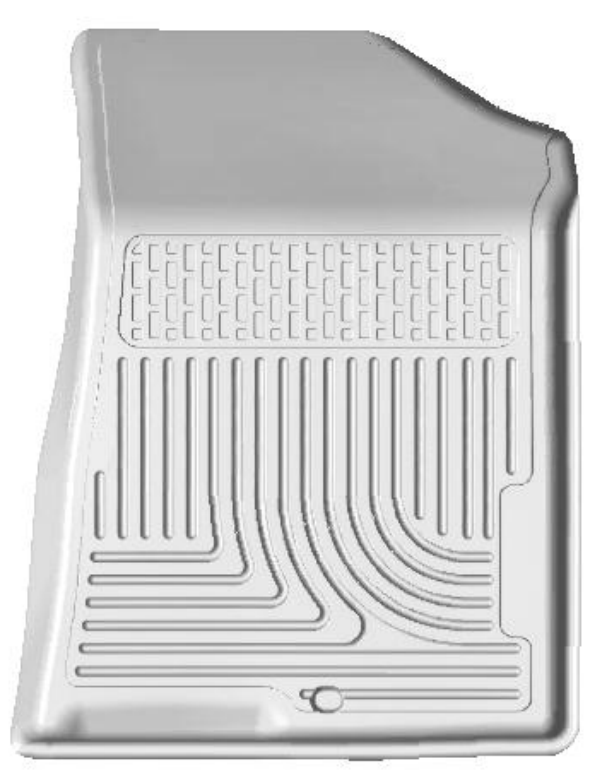
RIGHT OR PASSENEGER'S SIDE

TO EASE INSTALLATION OF YOUR SONATA FRONT FLOOR LINERS, FIRST SLIDE BOTH FRONT ROW SEATS ALL THE WAY BACK TO EXPOSE THE FRONT FLOOR PANS. ONCE YOU HAVE INSTALLED THE FRONT LINERS, REPOSITION THE FRONT SEATS AS DESIRED. NOTE THAT DRIVER'S SIDE LINER ATTACHES TO THE FACTORY MAT RETAINING HOOKS LOCATED IN THE DRIVER'S SIDE FLOOR PAN.