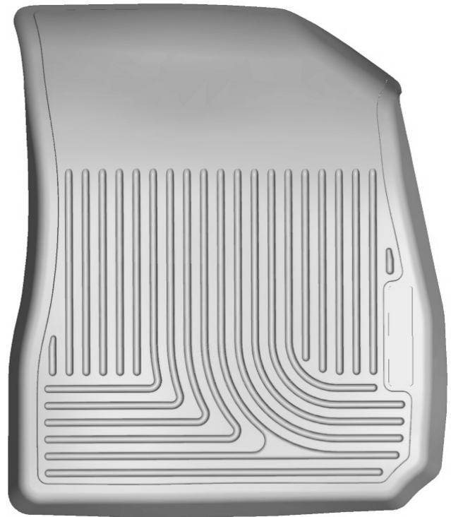
RIGHT OR PASSENEGER'S SIDE

TO EASE INSTALLATION OF YOUR MALIBU FRONT FLOOR LINERS, FIRST SLIDE BOTH FRONT ROW SEATS BACK TO EXPOSE THE FRONT FLOOR PANS. INSTALL LINERS TAKING CARE TO ATTACH THE DRIVER'S SIDE LINER TO THE FACTORY POST STYLE MAT RETAINERS. ONCE YOU HAVE INSTALLED THE FRONT LINERS, REPOSITION THE FRONT SEATS AS DESIRED.