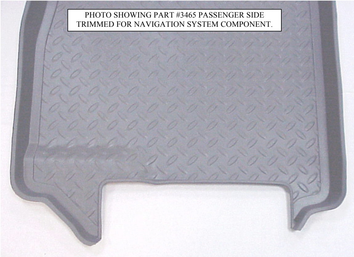
PHOTO SHOWING PART #3465 PASSENGER SIDE TRIMMED FOR NAVIGATION SYSTEM COMPONENT.