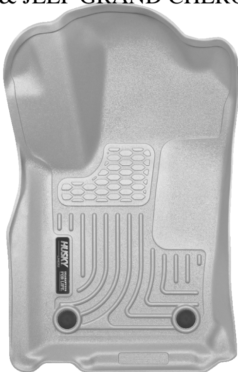
LEFT OR DRIVER'S SIDE