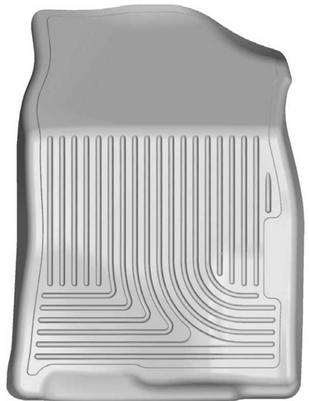
RIGHT OR PASSENEGER'S SIDE

TO EASE INSTALLATION OF YOUR CIVIC FRONT FLOOR LINERS, FIRST SLIDE BOTH FRONT ROW SEATS BACK TO EXPOSE THE FRONT FLOOR PANS. INSTALL LINERS TAKING CARE TO ATTACH THE DRIVER'S SIDE LINER TO THE FACTORY TWIST-LOCK RETAINERS. ONCE YOU HAVE INSTALLED THE FRONT LINERS, REPOSITION THE FRONT SEATS AS DESIRED.