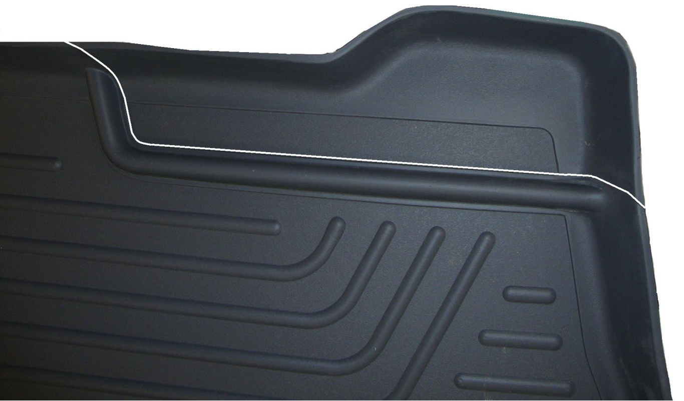
THE LINE THROUGH THE PART IN THE PHOTO ABOVE HIGHLIGHTS THE TRIM NEEDED FOR THE SUBWOOFER ACCOMMODATION. THERE IS A STEP IN THE PART TO GUIDE TRIMMING.