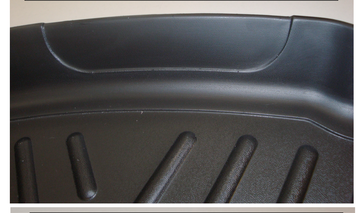
PHOTO SHOWING PART #42051 TRIMMED TO ALLOW ACCESS TO CARGO HOOK AND CARGO NET RETAINER.

PHOTO SHOWING PART #42051 CARGO HOOK AND CARGO NET RETAINER RELIEF AREA. NOTE: TRIM THIS AREA AWAY TO ALLOW EASY ACCESS TO THESE HOOKS. USE THE MOLDED IN STEP IN THE PART AS YOUR TRIMMING GUIDE.