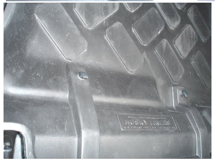
HUSKY LINER PART #3596 SHOWN INSTALLED IN THE FJ CRUISER. NOTE THAT LINERS MUST BE ATTACHED OVER FACTORY MAT HOOKS TO HELP SECURE LINERS IN POSITION.