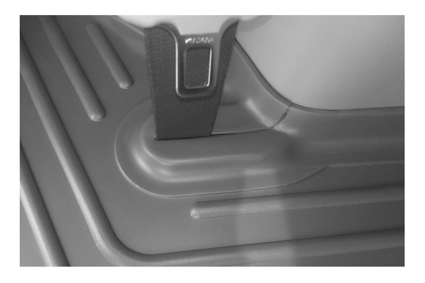
IMAGE SHOWING LINER TRIMMED AND SEAT BELT INSERTED INTO TRIMMED SLOT.