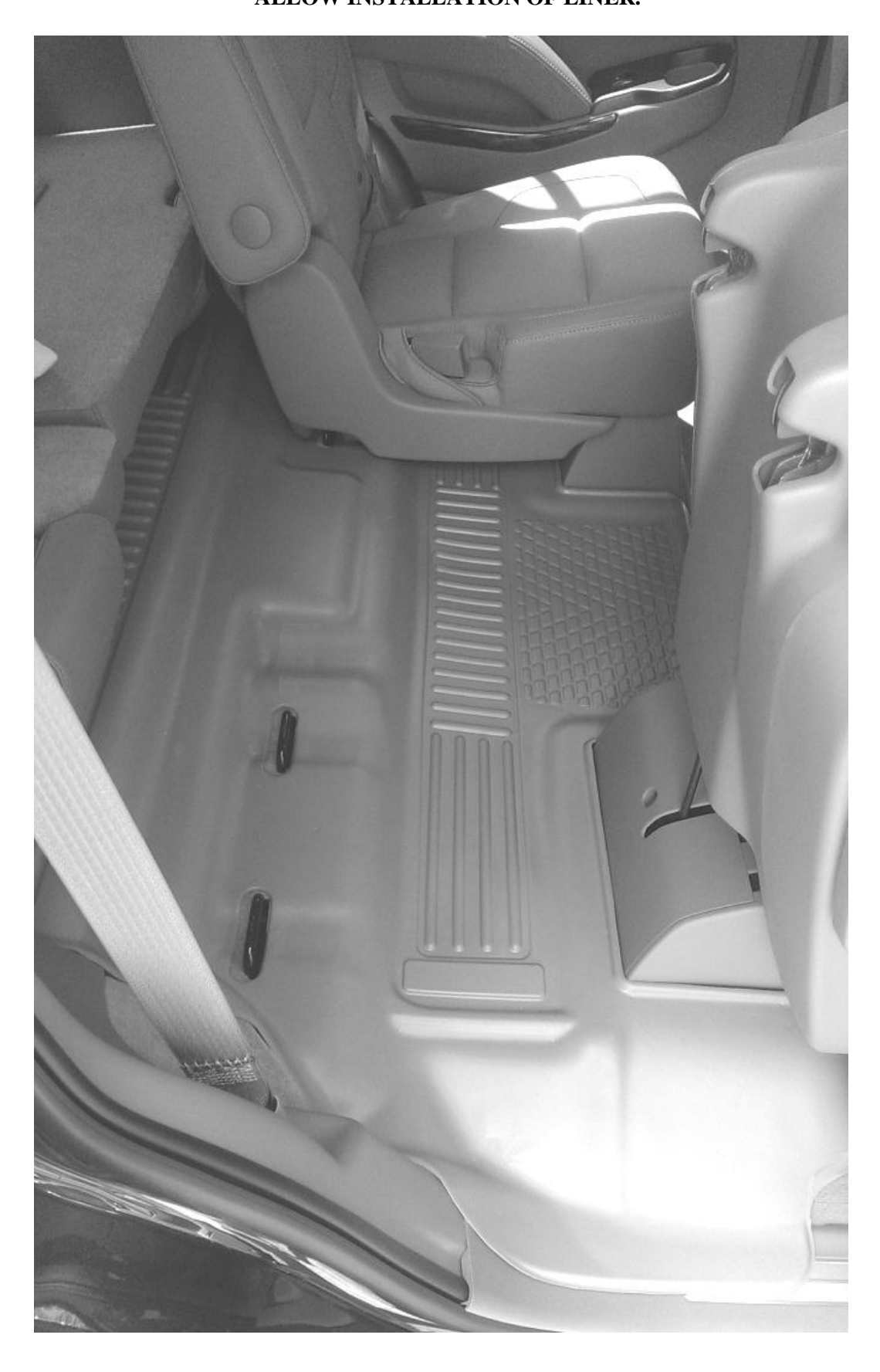
PART #1930 SHOWN INSTALLED—NOTE 2^{\rm ND} ROW SEATS MUST BE FLIPPED/FOLDED FORWARD TO ALLOW INSTALLATION OF LINER.