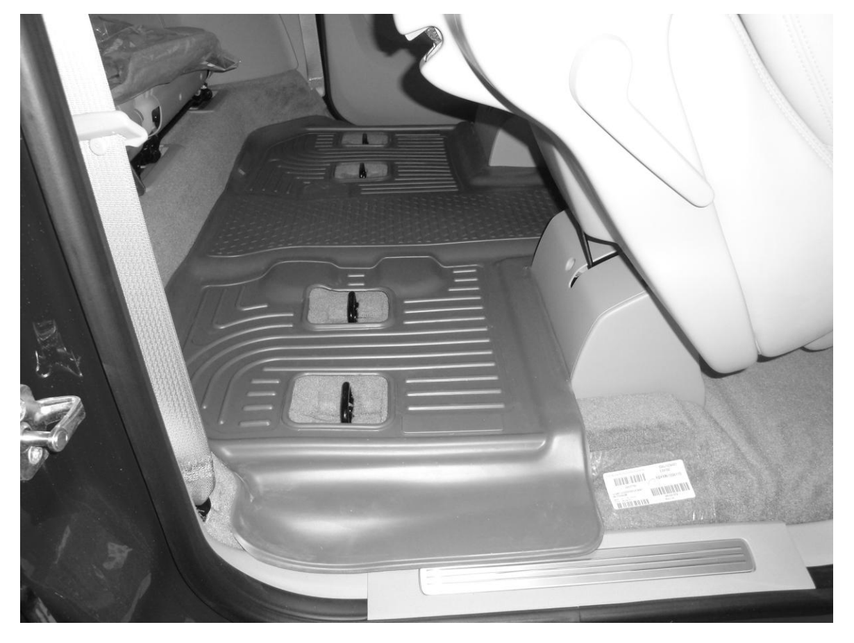
PART #1926 SHOWN INSTALLED—NOTE SEAT ATTACHES TO FLOOR THROUGH LINER

PART #1926 SHOWN INSTALLED—NOTE 2<sup>ND</sup> ROW SEATS ARE FLIPPED/FOLDED FORWARD