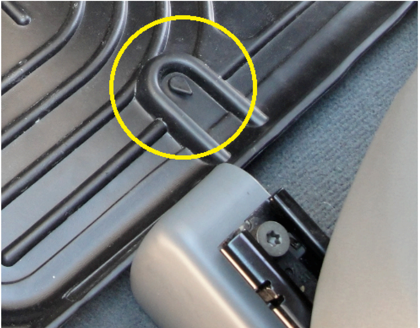
PHOTO SHOWING LINER PROPERLY INSTALLED OVER EXISTING DRIVER'S SIDE FACTORY MAT RETENTION HOOK

TO EASE INSTALLATION OF YOUR FLOOR LINERS, POSITION BOTH FRONT SEATS TO THEIR MOST REARWARD POSITION (SO AS TO GIVE THE MOST LEG ROOM). ONCE LINERS ARE INSTALLED, REPOSITION SEATS AS DESIRED.