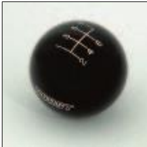
White with 6-Speed pattern . . . . .163 0056

The traditional Hurst Classic Shift Knob is available to fit your new Hurst Billet/Plus Shifter and compliment the interior of your Corvette. These quality crafted knobs measure 2-1/4" in diameter and are available in solid white with engraved black Hurst name and 6-speed pattern, or solid black with engraved white Hurst name and 6-speed pattern. Features a 9/16-18 threaded brass insert and supplied with a jam nut.