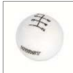
Black with 6-Speed pattern . . . . . 163 0156