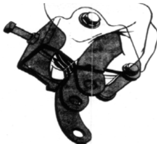
ALIGNING SHIFTER LEVERS WITH EDGES OF THE SHIFTER FRAME