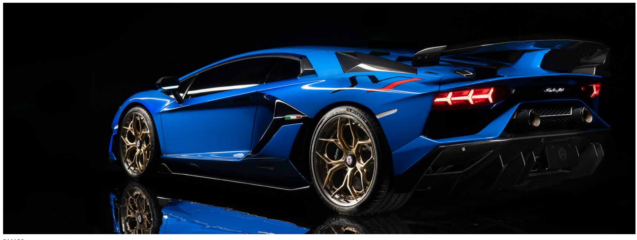
<u>$1</u>11$C Lamborghini Aventador SVJ