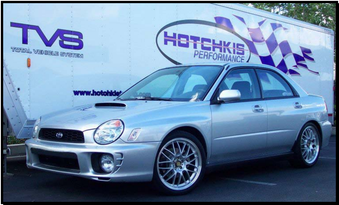
Another satisfied sway bar set customer.