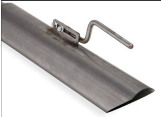
Figure 2 – 98-04 Passenger's Side Hanger