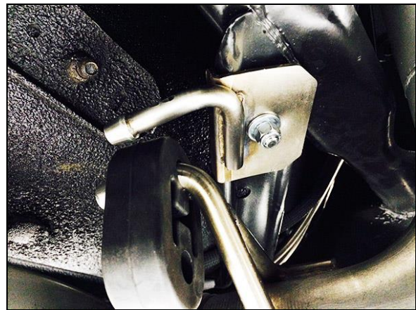
Figure 2 – Right front hanger bracket