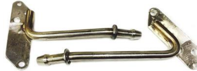
Rear over-axle hangers

Thank you for choosing to install a HOOKER™ exhaust system on your 1978-88 GM A/G-body vehicle. Although these systems have been specifically developed for direct fitment with HOOKER™ LS swap components for these applications, they will provide equally beneficial fitment, function and service life with other non-Hooker LS swap headers or non-LS engine equipped G-bodies through modification of the system inlet tubes, or construction of new ones, by a competent fabricator (use of double-hump crossmember required).