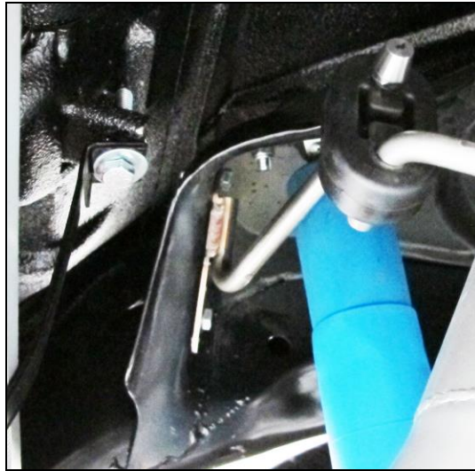
Figure 3 – Rear driver's side hanger (passenger's side hanger is similar)