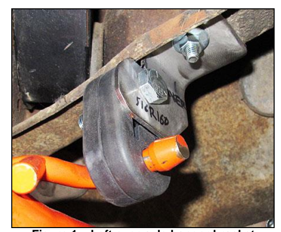
Figure 1 – Left over-axle hanger bracket