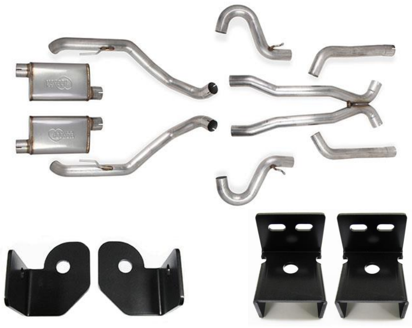
Front over-axle hangers