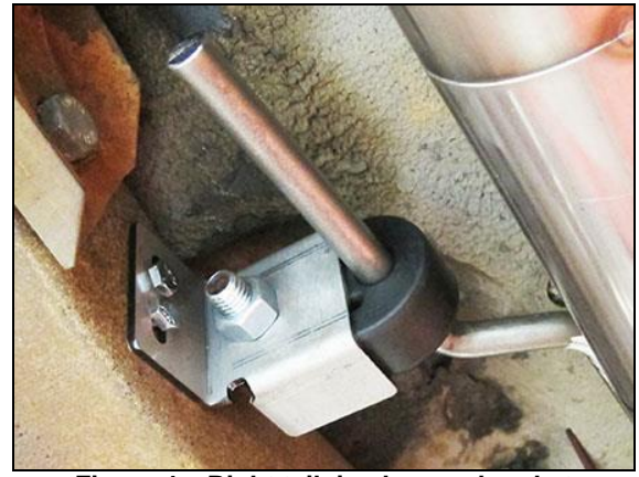
Figure 4 - Right tailpipe hanger bracket