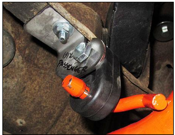
Figure 2 - Right over-axle hanger bracket