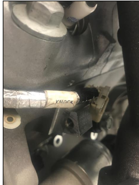
New Clocked Position