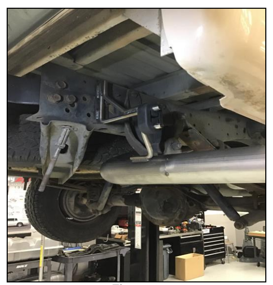
Figure 2 Rear tailpipe hanger to frame

NOTE: The intended attachment holes are sometimes occupied by rivets holding a specific stock exhaust hanger to the frame. You must remove the rivets and the stock hanger to enable proper installation of the supplied hangers. A cutoff wheel or grinder can be used to efficiently remove the rivet head prior to driving the rivet out of the hole with a punch and chisel.