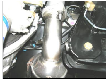
Examples shown – not actual parts