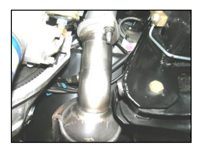
Examples shown - not actual parts