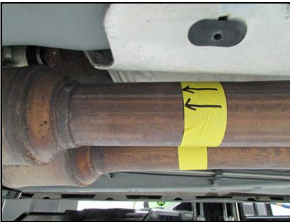
Figure 3 (Driver's Side)