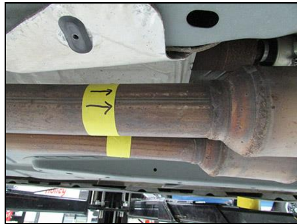
Figure 4 (Passenger's Side)