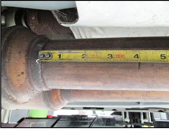
Figure 1 (Driver's Side)