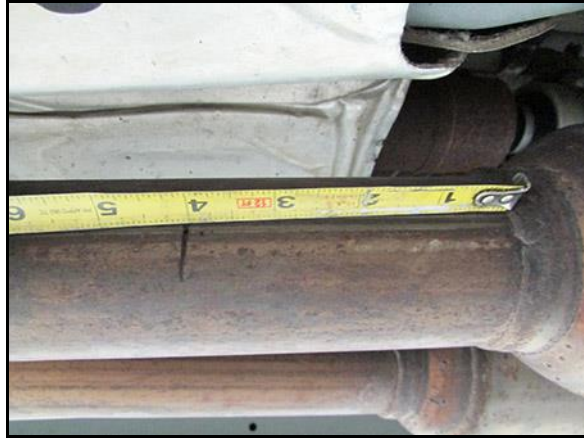
Figure 2 (Passenger's Side)