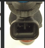
Multec 2 (early GM truck)