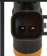
USCAR EV6 Style