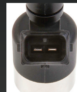
Jetronic Bosch-style EV1

558-206 - Fully terminated harness when using two Avenger-style 4bbl Holley TBI units.