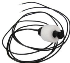
Low Level Float