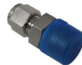
Stainless 3/8" NPT -1/4" OD tube fitting