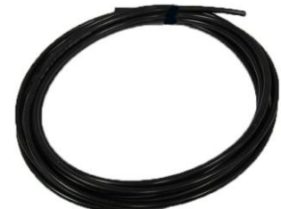
Polyurethane 1/4" OD tubing – 16 ft