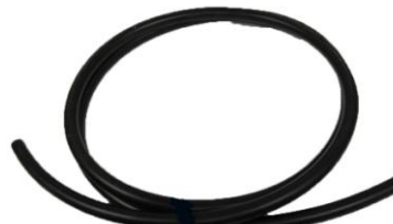
1/4" ID, 1/2" OD Tubing – 6 ft