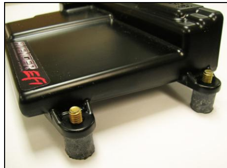
Rubber Isolation Dampers

An alternate acceptable method is to remove the existing hardware and use available ¼-20 rubber isolation dampers (shown in picture below). These are not included.