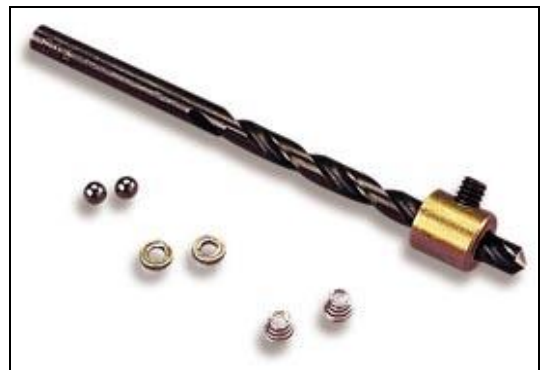
Figure 2 (Kit Components)

NOTE: The drill collar is pre-set, but if it should come loose, it must be set .300" from the drill tip.