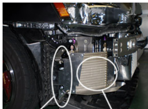
Stock oil cooler core HKS oil cooler core

Although LANCER EVOLUTION X has stock air cooled oil cooler, HKS test result shows after 5 laps of Fuji Speedway Short Course, oil temperature exceeded 130°C. With HKS largest size core in addition to stock oil cooler, cooling efficiency will be greatly improved.