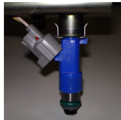
*Image of installation