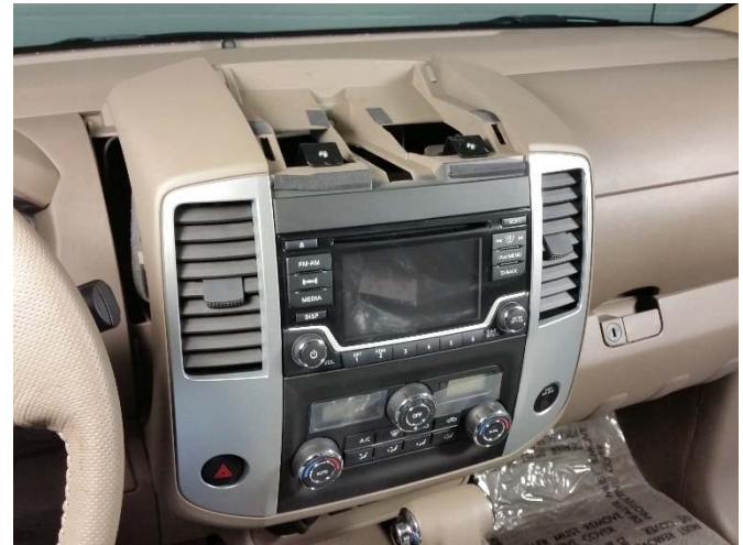
Pull the center IP away from the dash slightly. Full removal is not necessary.