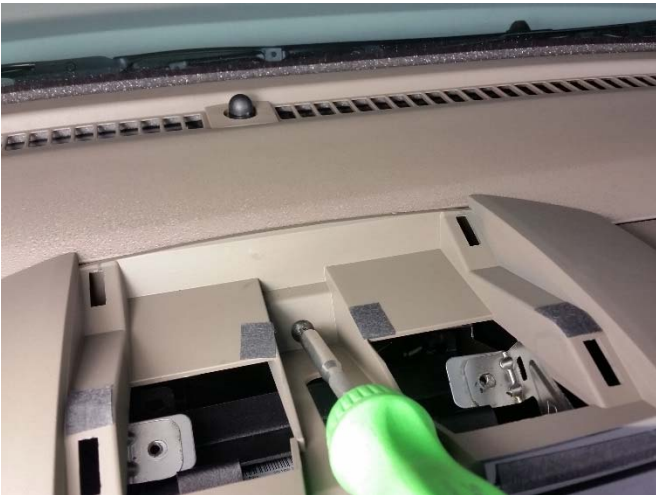
Remove three (3) Phillips head screws.