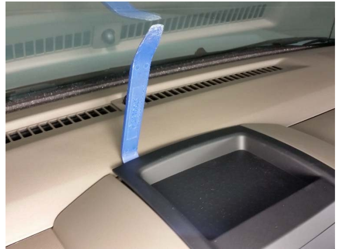
Remove top center trim panel by gently prying along the edges with a panel removal tool.