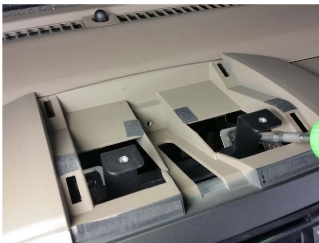
Slip the lower rear mounting bracket under the IP and into place. Re-attach the IP into the dash.