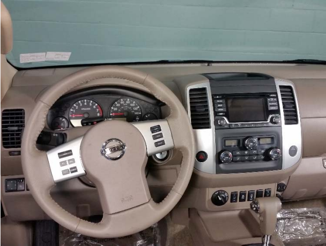
View of Frontier prior to installation.