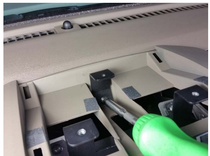
Re-install the OEM hardware for the front and rear support brackets and tighten.