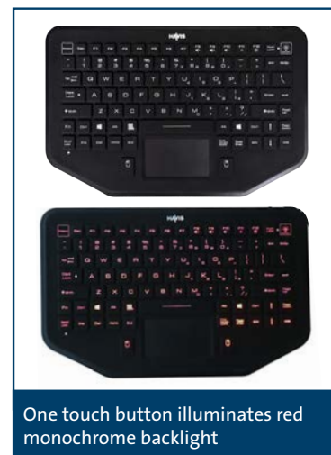
One touch button illuminates red monochrome backlight

The System includes the Havis Rugged Keyboard (KB-101) and Keyboard Mount (C-KBM-201). Featuring red monochrome backlit illumination to reduce eye strain, the IP65 rated keyboard rests securely in the patent pending mount allowing ease of use and adjustment.