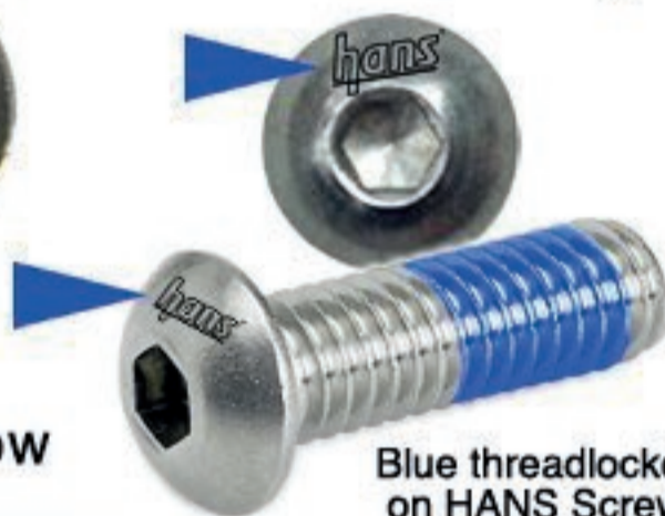
Blue threadlocker on HANS Screw

Genuine HANS Screws are Marked with the HANS Logo