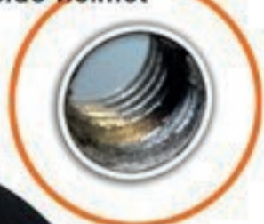
Nutwasher bonded inside helmet

Snell SAH2010 helmets have a threaded insert (nutwasher) bonded directly inside the helmet shell. Anchors for these helmets are sold without nutwashers. These anchors use an indexing collar instead of a post and include a tool to orient or index the anchor from the outside of the helmet shell.