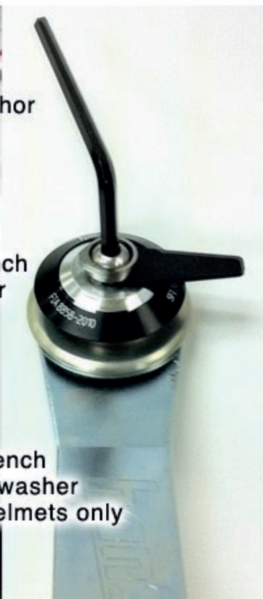
Large wrench holds nutwasher For SA helmets only