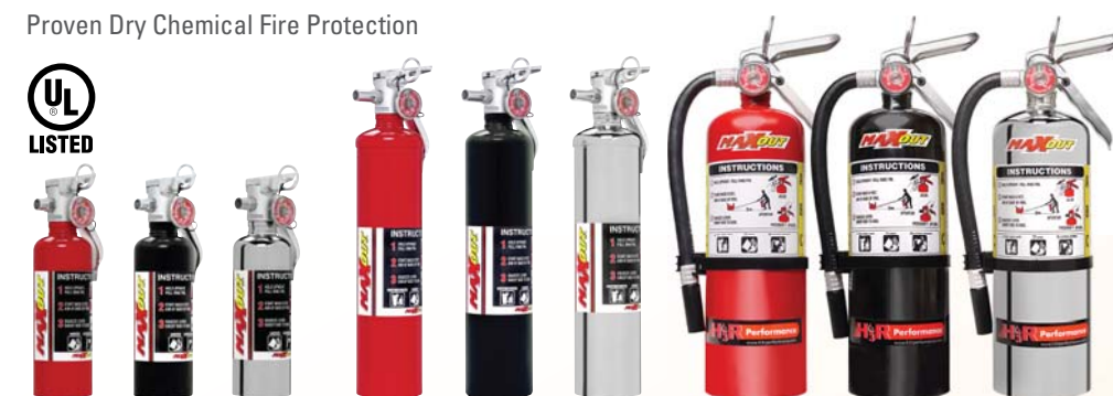
MX100R MX100B MX100C MX250R MX250B MX250C MX500R MX500B MX500C