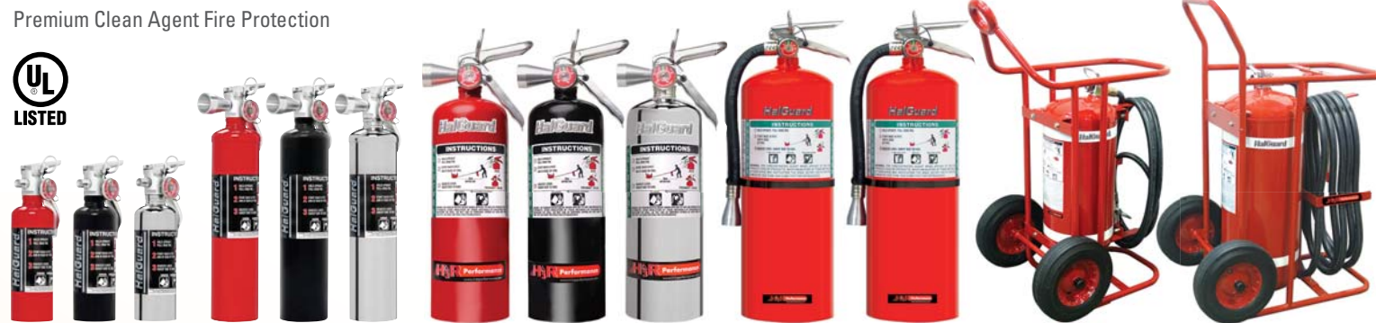
HG100R HG100B HG100C HG250R HG250B HG250C HG500R HG500B HG500C HG1100R HG1550R HG6500R HG15000R