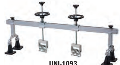
UNI-1093 Uni-Bridge™ Extended Pull 49" (Double Column)