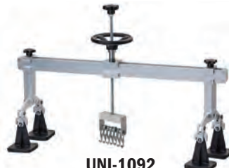
UNI-1092 Uni-Bridge™ Standard Pull 34" (Single Column)