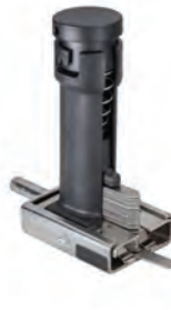
UNI-9600 Tab-Shooter™ Uni-Tab Auto-Feed Tool