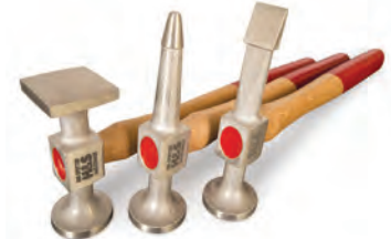
UNI-7803 Aluminum Hammer Set (3-Piece)