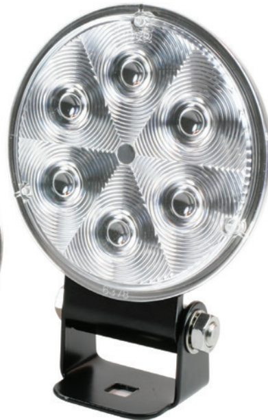
LED WHITELIGHT™ WORK LAMP WITH MOUNTING BRACKET