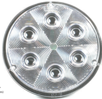
PAR 36 LED WHITELIGHT™ CONVERSION BULB