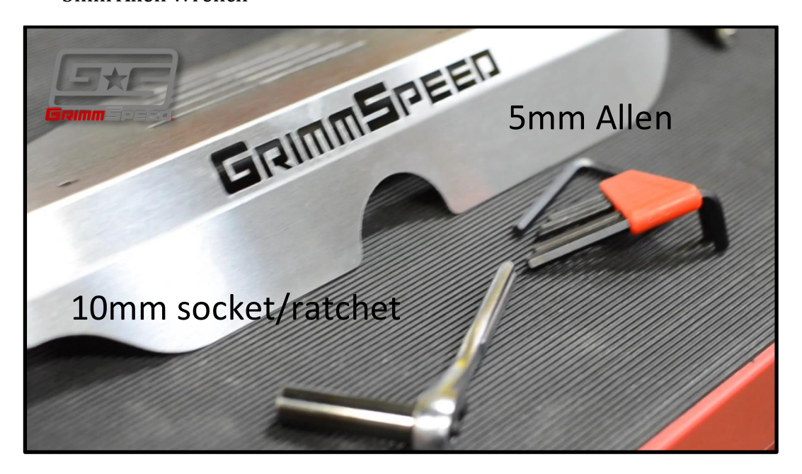
Figure 1: Tools

<u>Tips:</u> Use care to not drop the anodized spacers into your engine bay, but if you do, don't burn yourself while you reach for them!