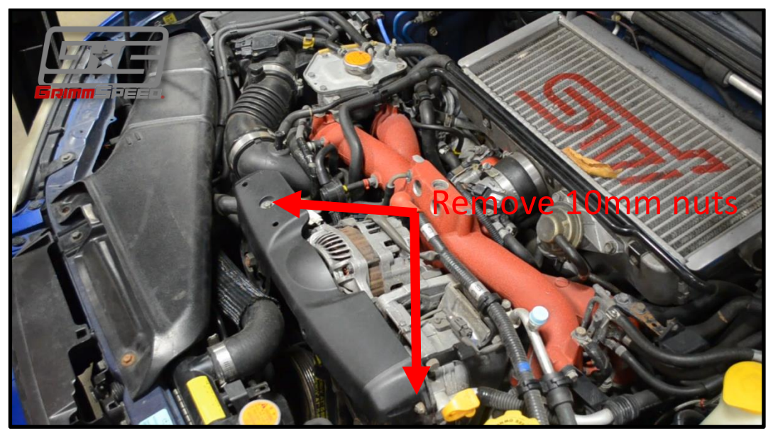
Figure 2: Remove 10mm nuts on each side

2. Now, remove your factory alternator cover if you still have it in place. This will require a 10mm socket to remove the two fasteners securing it. Set the nuts and the cover aside, you will not be needing them.