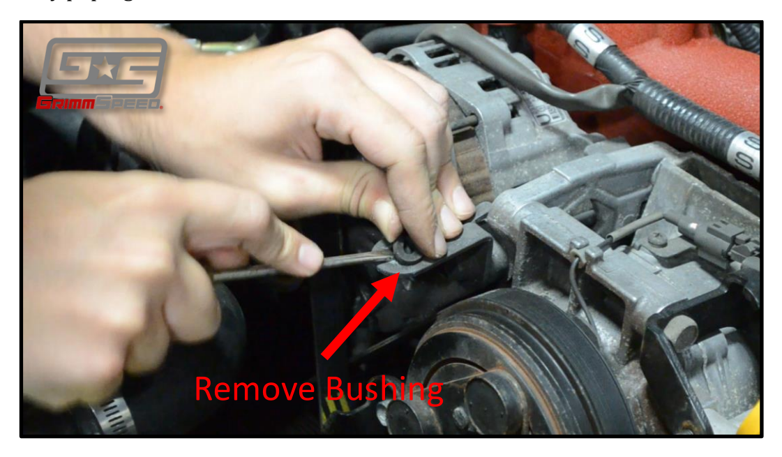
Figure 3: Remove Bushing

3. Next, remove the small rubber grommet from the driver's side bracket. Yours may pop right out, ours was a bit stubborn.