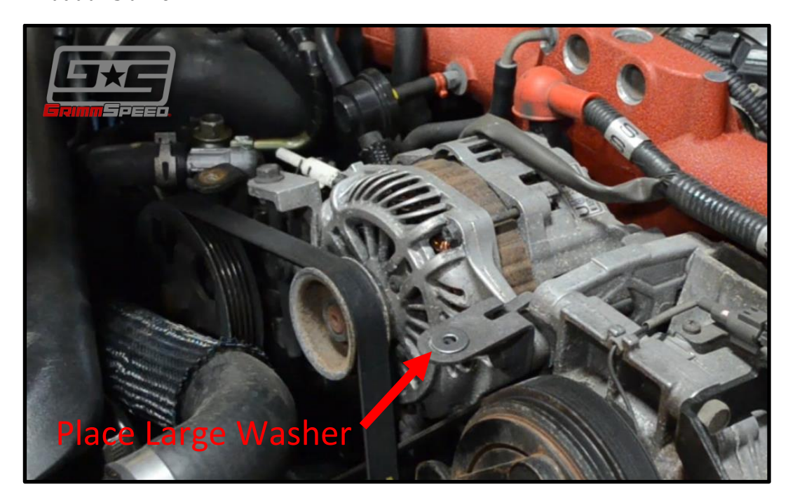
Figure 4: Place larger washer

Get the nut started, but do not tighten all the way, you'll want to be able to move it around. If your vehicle doesn't have this bracket, you'll need to install it at this time!