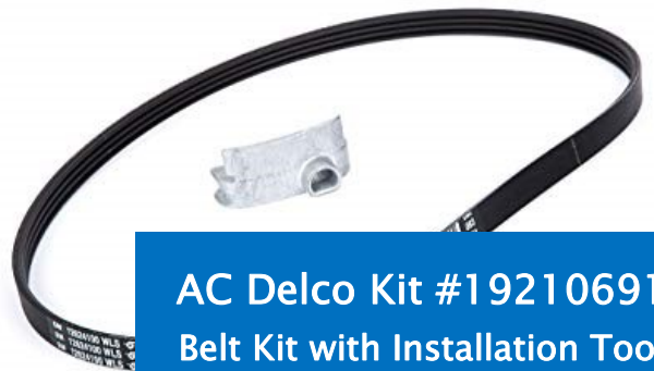
AC Delco Kit #19210691 Belt Kit with Installation Tool