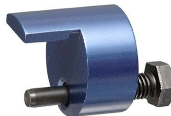
Aftermarket Belt Installation Tool