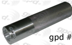
gpd # 5811490

After the snap ring is removed, use gpd #5811490 switch puller to remove the original switch, to ensure no damage occurs to the switch.