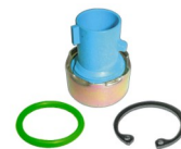
gpd # 1711334

If the original switch is damaged, replace it with gpd #1711334, high pressure compressor switch.