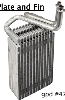
Plate and Fin