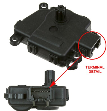
gpd #1712295 2007–2014 Ford Expedition 131” Wheel Base