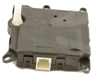
gpd #1711895 2002–2006 Ford Expedition